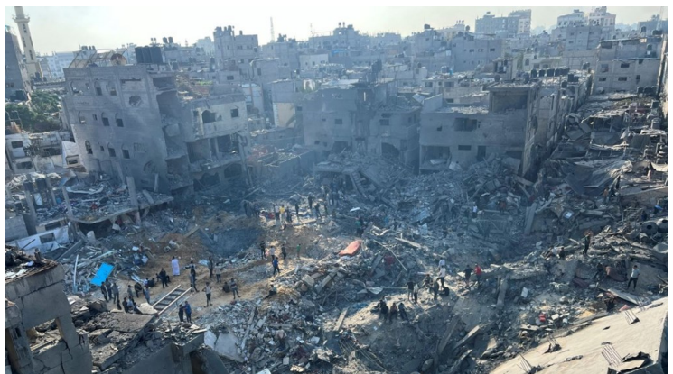
An Israeli strike on a refugee camp in Gaza on November 2, 2023. No one knows how many more bodies lay under the rubble.