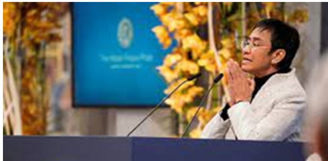
Maria Ressa giving her speech accepting the Nobel peace prize in 2021

So, America, you have been warned. Ressa is very worried about what could happen here in 2024. We need the rule of law in the virtual world. We need to find a way to make the original promise of the World Wide Web come true. Campaigns of lying for political advantage is not “free speech”. If we revere our democracy, if we hold it sacred, then we should treat our public spaces, the forums where we express ourselves, just like we treat the spaces inside a courtroom where telling a lie is perjury. For a democracy to work, we must find good sources who want to report the truth. “You can’t have integrity of elections without integrity of facts.”